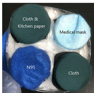
FIGURE 1 The system mocking human breath for evaluation of the efficacy of masks

AIV. Taken together, we presumed that the virus amount declines by 50% if the C_t value increases by 1, and the virus amount declines by (100 \times (1 - 1/(2^{\gamma})))\% if the C_t value increases by Y, in this study.