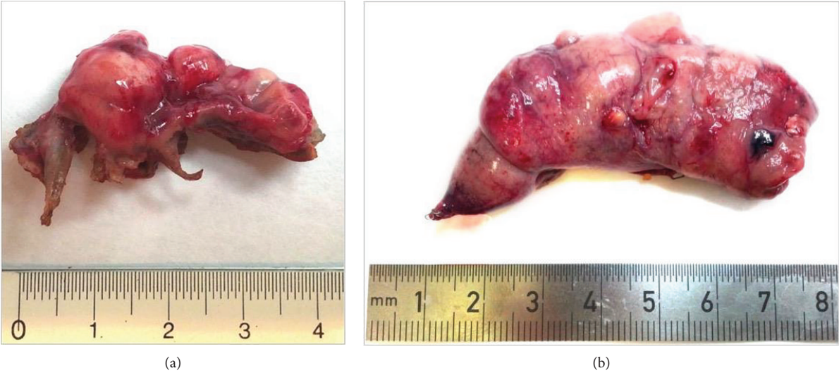
FIGURE 2: Gross findings of the upper lobe at first (a) and second (b) surgical interventions. Emphysematous changes with marked bulla formation were present.