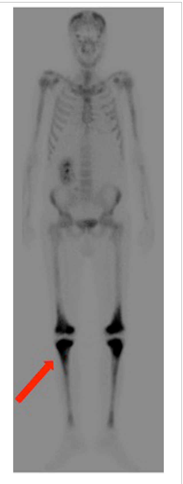
FIGURE 3 | Bone scan demonstrating symmetric diametaphyseal radiotracer uptake in the long bones of the lower limbs [ red arrow ].

Anakinra was thereby started at a standard daily subcutaneous dose of 100 mg (20). Already 2 days after initiation of anakinra treatment, laboratory tests showed a steep reduction of ESR and CRP levels (22 mm/1 h and 16 mg/L, respectively), and the patient reported a marked improvement of fatigue and asthenia. In the following days, repeated echocardiography evaluations revealed progressive reabsorption of the pericardial effusion. The patient was thereby discharged and re-evaluated after 2 months of daily anakinra treatment. At this point, inflammatory markers had completely normalized, hemoglobin levels increased, and the patient reported no signs of cardiac failure and a considerable improvement in quality of life. A new echocardiography showed a substantial reduction of pericardial effusion, which had a maximum thickness of 16 mm. Anakinra was maintained as monotherapy, and the patient remained asymptomatic in the absence of disease flares for the following 1 year. Imaging restaging of ECD confirmed improvement of heart involvement and stability of retroperitoneal fibrosis.