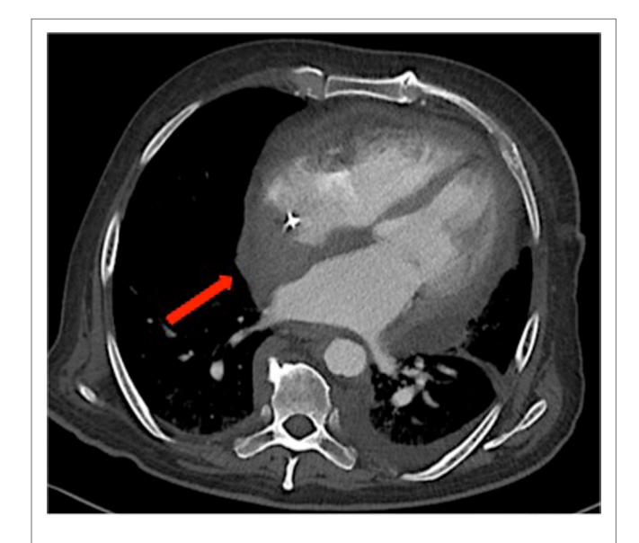
FIGURE 1 | A contrast-enhanced computed tomography showing thickening of the pericardial sheets, pericardial effusion and a pseudo-tumoral infiltration of the right atrium [ red arrow ].

Over the following days of hospitalization, dyspnea and chest pain progressively worsened. Repeated echocardiography revealed a closure of the pleuro-pericardial window and relapse of the pericardial effusion, with a maximum thickness of 40 mm. A whole-body contrast-enhanced computed tomography (CT) confirmed pericardial effusion with thickening of the pericardial sheets, while also revealing a pseudo-tumoral infiltration of the right atrium (Figure 1). Moreover, abdominal scans revealed solid tissue surrounding the right kidney and aorta (Figure 2). Together with cardiac involvement, these findings of retroperitoneal involvement with peculiar "coated aorta" and "hairy kidney" radiologic signs pointed at a diagnosis of ECD. Since the skeletal system is almost invariably involved in ECD, a bone scan was then requested, which revealed pathognomonic symmetric radiotracer uptake in the long bones of the lower limbs (Figure 3). A CT-guided biopsy of the perinephric solid tissue was performed. Histology studies identified xanthogranulomatous infiltration with foamy histiocytes staining positive for CD68, but negative for S100 and for CD1a, all findings diagnostic for ECD. Molecular techniques revealed the presence of the BRAFV600E mutation in pathological histiocytes, as described (24).