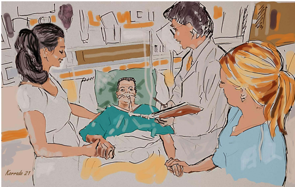
Figure 2 The illustration shows an example of interaction and cooperation between family members and clinicians at the patient's bedside.

ventilation aged 65 or more, older ICU survivors have a high burden of palliative care needs that persist at 1 month after discharge, fatigue being the most prevalent symptom. 36 Family engagement is one of the many important interventions that ICU staff can apply in order to prevent PICS. 29,37 Lastly, it is also important to consider that family members themselves may also experience psychological and physical risks when caring for critically ill patients. 38,39 The creation of opportunities for closeness and family care rituals for relatives involved with providing care for a loved one in the ICU was associated with a reduced occurrence of symptoms of post-traumatic stress disorder (PTSD) in family members at 90 days after patient's death or ICU discharge. 40