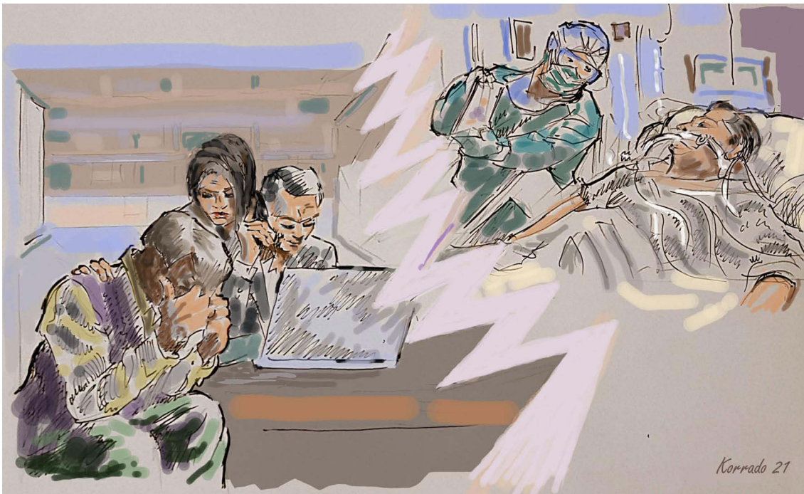
Figure 3 The illustration shows how communication between patient, family and clinicians takes place during COVID-19 pandemic, using digital devices (tablet and laptop).

been scarce or null. Clarifying patient's code status among the treating professionals also is particularly important, especially during COVID-19 pandemic, to ensure all the members of the treating team have a clear idea of the goal of care for each patient. For example, disproportioned cardiopulmonary resuscitation (CPR) could be harmful both for families, who are at risk of psychological distress and may rely on unachievable goals or improvements, but also for healthcare workers performing advanced life support maneuvers with augmented risk of aerosolization and strain of PPE resources. 77 Additionally, there is a large debate on the outcomes of COVID-19 patients undergoing CPR. 78 Consultation of palliative care teams, when available, helped clarifying advance directives and minimize futile resuscitation efforts. 79,80 Some institutions registered an increase in palliative care consultations during COVID-19 outbreak 81 even though it is reported that palliative care consultations often happened late during hospitalization and in a minority of patients. 76,82 When a specialty palliative care team was not available strategies of integrative primary palliative care delivery were adopted by anesthesiologists trying to optimize patient's comfort while minimizing staff exposure to infection. 7,83