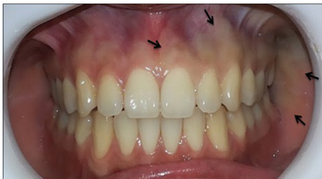
Figure 2: Ischemic zone (arrow) from the middle line of the buccal gum and mucosa to the left cheek.