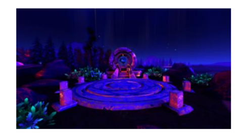
Figure 2 Descriptions and illustrations for each of the categories of modules in the skills based VR program. The categories of modules include: interoceptive, education, 360 degree videos, games and dynamic breathing. VR, virtual reality.