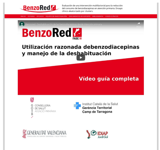
Figure 3 BenzoRed support web page for professionals.

Attending the workshop training, downloads of the monthly feedback reports and visits to the support web page will be registered and monitored. Healthcare centres randomised to the usual care group will not