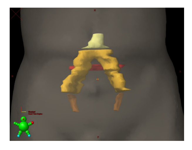
Figure 3. Comparison of upper border based on bony landmarks and the nodal stations on computed tomography (CT) scan. Red — L5–S1 junction, yellow — common iliac vessels, mustard — internal and external iliac vessels, orange — obturator vessels

which examined 60 patients and demonstrated that the use of L5-S1 as the superior border of radiation therapy fields in rectal cancer would lead to a 94% omission of internal iliac nodes. Similarly, Sanjee et al. [18] compared 2-dimensional and 3-dimensional plans in 86 patients with rectal malignancies and found that 32 out of 86 patients experienced a geographical miss of internal iliac nodes when L5-S1 was used as the superior border.