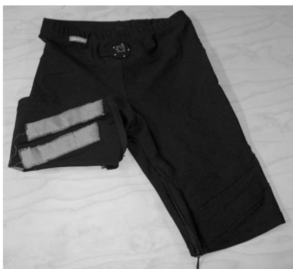
Figure 3 EMG shorts used to collect muscle EMG activity from thigh muscles.

measures and ~100 derived variables with clear biochemical interpretation and significance. The directly measured metabolites include lipoprotein subclass distribution with 14 subclasses quantified including particle concentrations and individual subclass lipids, low-molecular-weight metabolites such as amino acids, ketone bodies, and creatinine, and detailed molecular information on serum lipid extracts including free and esterified cholesterol, sphingomyelin, degree of saturation and \omega -3 fatty acids. Derived variables include selected ratios of metabolites implicated in lipolysis, proteolysis, ketogenesis and glycolysis as well as reagents and products of enzymatic reactions and measures obtained with the extended-Friedewald formula, eg. apolipoprotein A-I and B [45]. Further details of the NMR spectroscopy, quantification data analyses, as well as the full metabolite identifications can be found from [46,47].