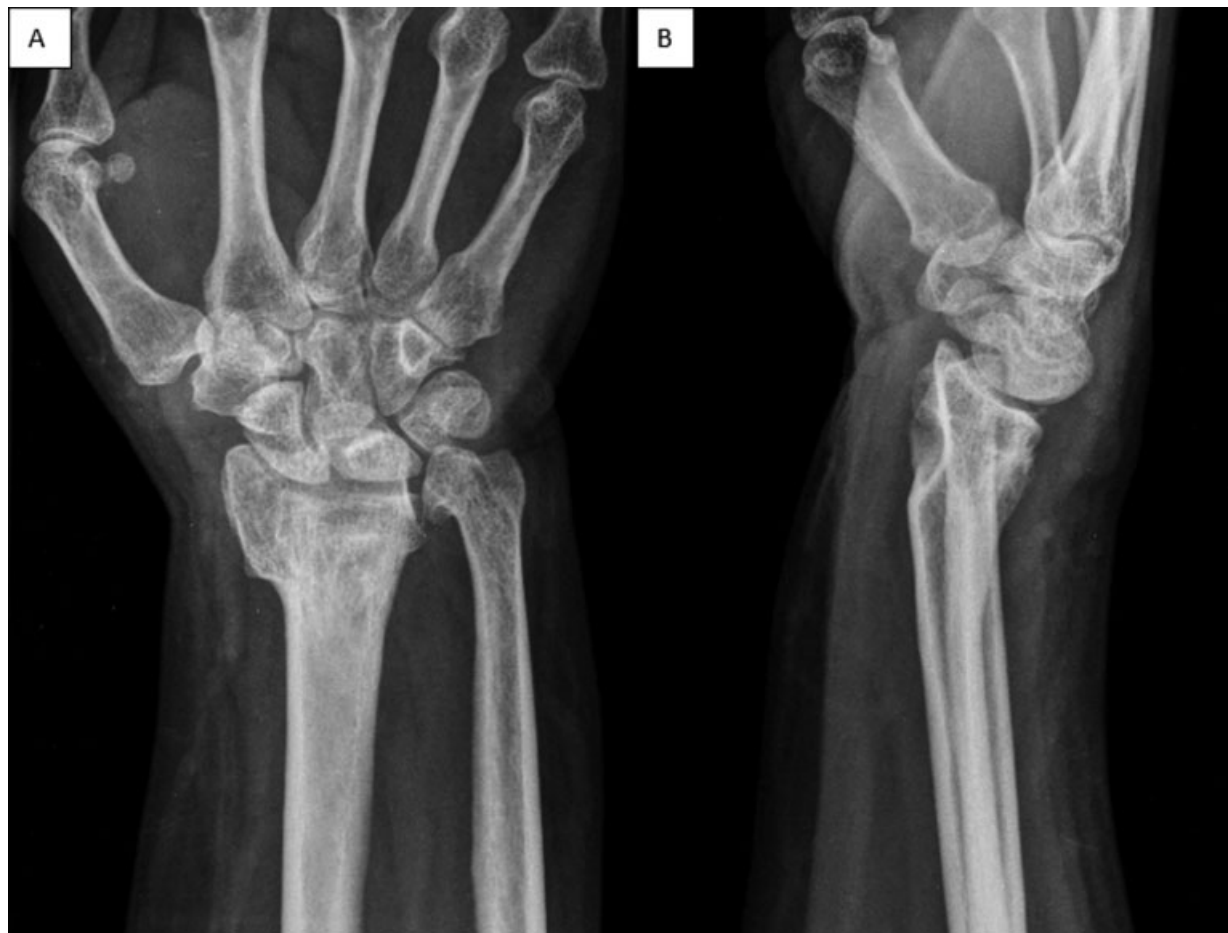
Fig. 1 Posteroanterior (A) and true lateral (B) radiographies of the left wrist showing vicious consolidation with dorsal deviation, radial shortening, ulnar head deformity, and adaptive carpal instability.

In the early 1980s, Charles Hull developed and conceptualized 3D printing, allowing the creation of objects based on material deposition layer by layer. Since then, 3D printing advanced and models present better resolution, faster production, and lower cost; in addition, there is a greater variety of materials for printing. 7