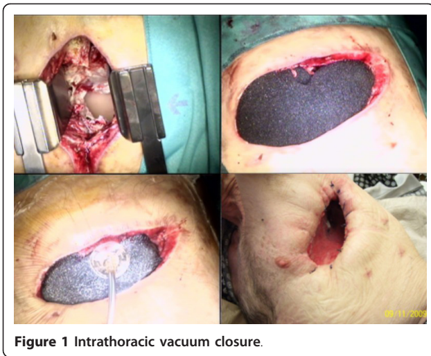
Figure 1 Intrathoracic vacuum closure.

Suturing the skin flaps on the margins of the OWT constituted the thoracostoma. The VAC sponges (black GranuFoam Standard Dressings, 400 - 600 microns) were inserted in the residual pleural cavity through the thoracostoma (Figure 1.) to fill the entire pleural space. The sponges covered the leakage directly; no membranes were used for the BPF or the remaining lung.