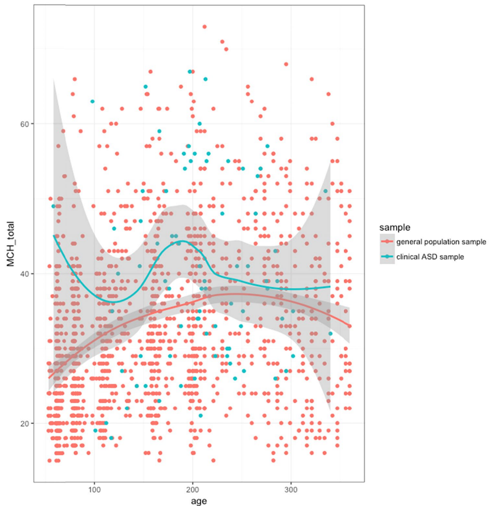
Fig. 3 Total scores on the Dutch version of the MCH-FS in relation to the participant's age (data points and Loess trend with 95% confidence interval)

The results of the current study show that the Dutch version of the MCH-FS—called the SEP—has a good internal consistency in both the general population sample and the (clinical) ASD sample. The response patterns showed adequate use of the theoretical score range, and (slight) positively skewed distributed answer patterns as is to be expected for a screening instrument (Counsell et al. 2011). In addition, caregivers of children with ASD reported more symptoms of feeding problems on the instrument compared to caregivers in the general population. They also showed a similar global response pattern on the individual items of the MCH-FS, in the sense that for most items they scored higher than the general population sample. The only exception was item 5 ('How long do mealtimes take for your child?') which indicated that children with ASD have shorter meals than children from the general population. This underscores the observation that rapid eating has been reported to be a common feeding problem in individuals with developmental disorders (Anglesea 2008) and is specifically reported often in