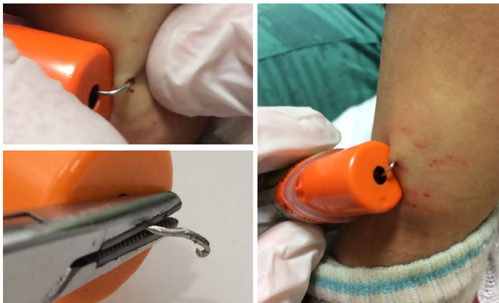
Fig. 1 Case 1

A 16-month-old boy developed an allergic reaction while eating at a restaurant. His mother held her son on her left hip and injected an EpiPen Jr with her right hand against his left thigh, using a push-and-hold approach (Fig. 3). He initially did not react to the injection, but after a few