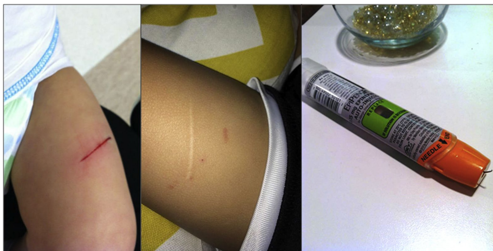
Fig. 3 Case 3

seconds, he became more responsive and began to kick his leg, resulting in a 3-cm laceration of his left thigh. His mother described the needle as “stuck like a hook” under his skin and she was initially unable to remove it. She had to insert it further to finally work it free. On removal, the needle was curved and uncovered. This case has been reported previously [4].