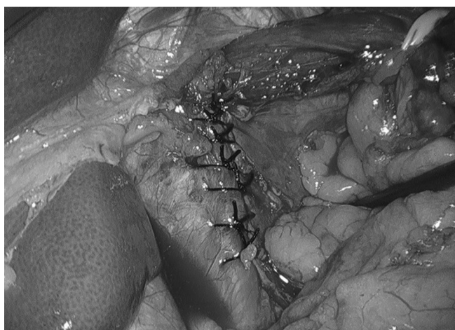
Figure 2. Cruroplasty.

agus. Hernias >5cm in size noted on preoperative barium study 15 or endoscopy, or the presence of attenuated crura were criteria for the use of human acellular dermal graft. A 5cm x 8cm graft of human acellular dermis is fashioned into a “U” shape and is placed as an onlay patch over the cruroplasty posterior to the esophagus with the tails of the “U” placed to either side of the esophagus. Care is taken to ensure the mesh is not impinging on the esophagus. An Endoscopic Universal 65 Hernia Stapler (Covidien, Mansfield, MA) is used to secure the mesh to the diaphragm ( Figures 3 and 4 ). A 360-degree fundoplication is then fashioned over a 54 French bougie. Completion endoscopy is performed to visualize the fundoplication and ensure no esophageal or gastric injury. Percutaneous endoscopic gastrostomy tubes are placed selectively in patients with large paraesophageal hernias in which more