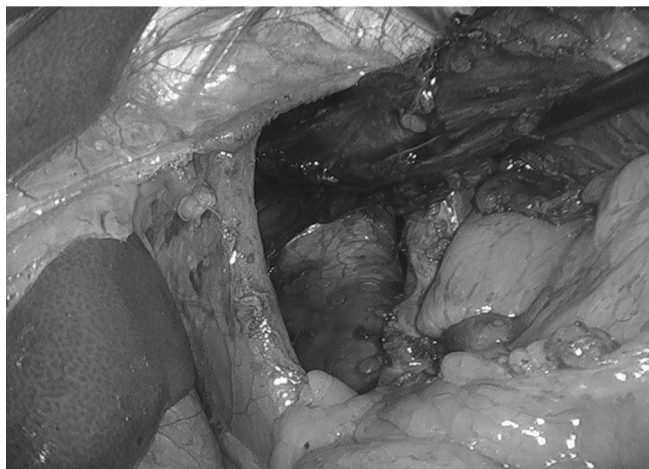
Figure 1. Hiatal defect.

A standardized technique was utilized for all laparoscopic paraesophageal hernia repairs. A minimum of 2.5cm of intraabdominal esophageal length is obtained with extensive mediastinal dissection ( Figure 1 ). Intraabdominal esophageal length is measured intraoperatively from the diaphragm to the gastroesophageal junction while the stomach is held tension-free. Complete mobilization of the fundus and cardia of the stomach is performed with preservation of the peritoneal covering of the crura. A 54 French bougie is passed per os and directed along the lesser curvature of the stomach to size the cruroplasty. The diaphragmatic crura are closed using interrupted permanent sutures ( Figure 2 ) to allow for approximation of the crural fibers, allowing for a 5-mm instrument to be placed between the esophagus and crural closure while the bougie is in position, thus ensuring no extrinsic compression from the crural closure is placed on the esoph-