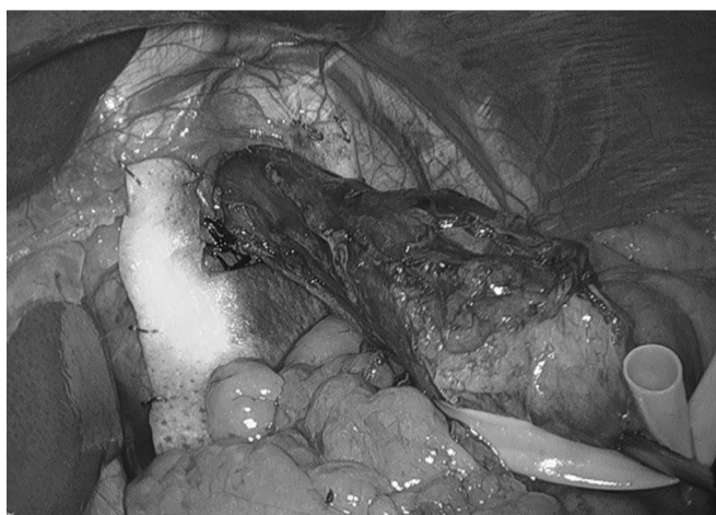
Figure 4. Human acellular dermis only.

than half of the stomach has herniated through the hiatal defect with the appearance of a dilated or atonic stomach after the completion of the dissection.