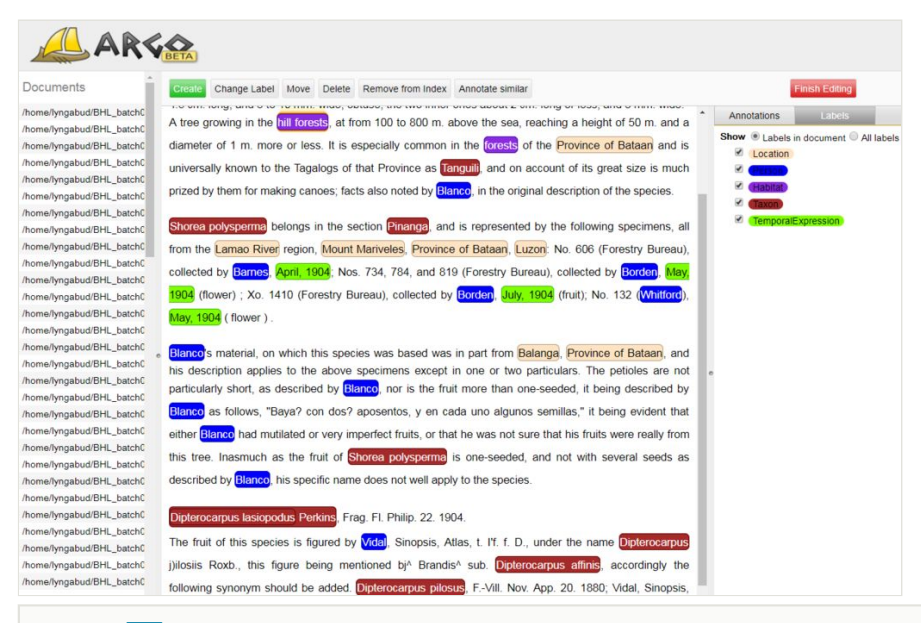
Figure 1. doi

In order to support the annotators, we utilised Argo, a workbench for building text mining solutions (Rak et al. 2012). Argo is a web application that does not require any complicated platform-dependent installation procedures*6. It has its own library of text processing components and a file store to hold document collections. We made use of the Argo's Manual Annotation Editor to create and revise annotations directly in text. Fig. 1 shows the graphical user interface of the Editor. It is a convenient and straightforward tool for domain experts to mark-up documents according to a user-specified annotation schema. The Editor allows annotators to change annotation labels and to move or delete annotations easily. An annotator can also quickly tag similar entities by using a function called "Annotate similar".