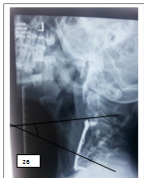
Figure 3: POSTOPERATIVE XRAY