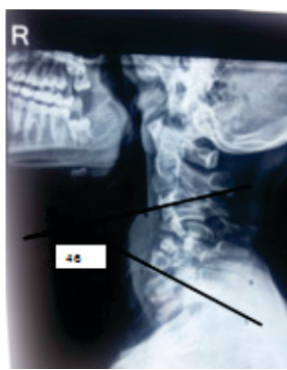
Figure 1: PREOP XRAY

anterior and posterior procedures [7-9]. There are very few documented cases of treatment of cervical kyphosis due to NF. Even its reliable treatment guidelines are yet to be established. Myelopathy develops usually as a result of the posterior aspect of the vertebral body causing compression of the spinal cord. Surgical correction is required with special care, in restoring the normal alignment in affected vertebral bodies due to the thin and fragile bone common with this disorder. This report describes