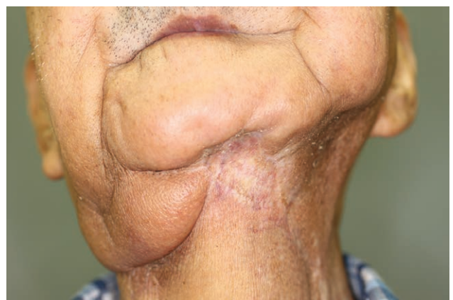
Fig. 4. The wound healed without any infection or ulcer recurrence on 6 months after the first surgery.