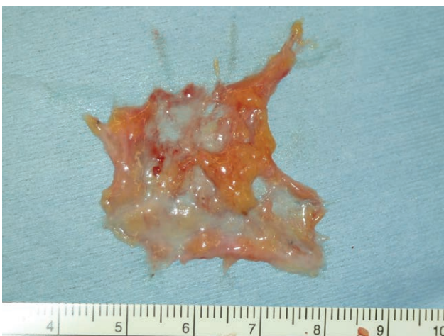
Fig. 2. A PAT graft measuring 4×4cm was harvested from the left inguinal region.

In our cases, we debrided necrotized or infected tissue after the first reconstructive surgery, and then applied NPWT to prepare a wound bed. However, the granulation tissue was insufficient to cover the entire wound surface because the bone and artifact were still exposed. The wounds were hypovascular or even avascular, so the promotion of angiogenesis and granulation was difficult. Therefore, we