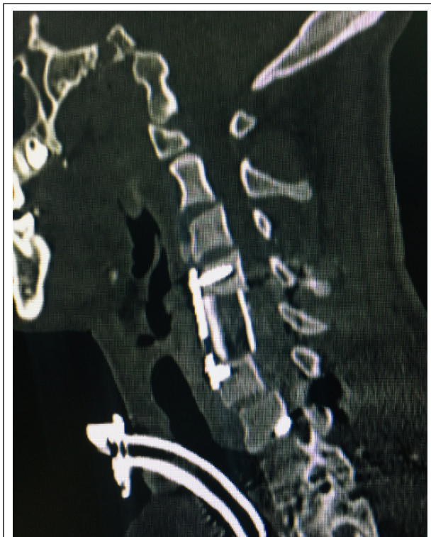
Figure 4. One month postoperative computed tomography sagittal section showing anterior cervical plate and screws at C4 and C6 with fibular graft in between.

An autologous strut graft was harvested from the left mid fibula. Again in the supine position, the anterior column was reconstructed with appropriate size autologous fibular strut graft followed by stabilization with anterior cervical plate and screws (Figure 4).