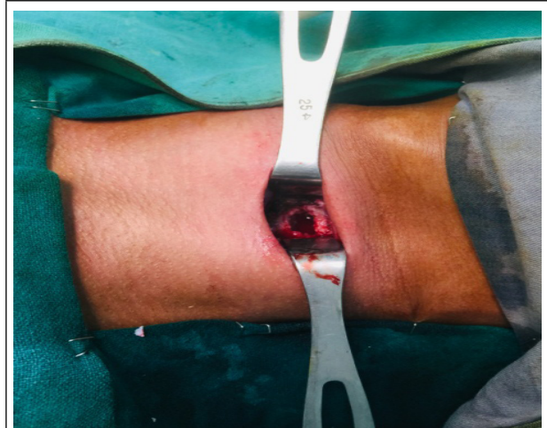
Figure 2. Anterior corpectomy of C5 vertebra.

and Robinson approach via the longitudinal incision. 6 Esophagus, trachea, and carotid sheath were gently retracted and protected. Anterior C5 median corpectomy and fracture fragment of C4 were removed with the aid of a microscope and fluoroscopy (Figure 2).