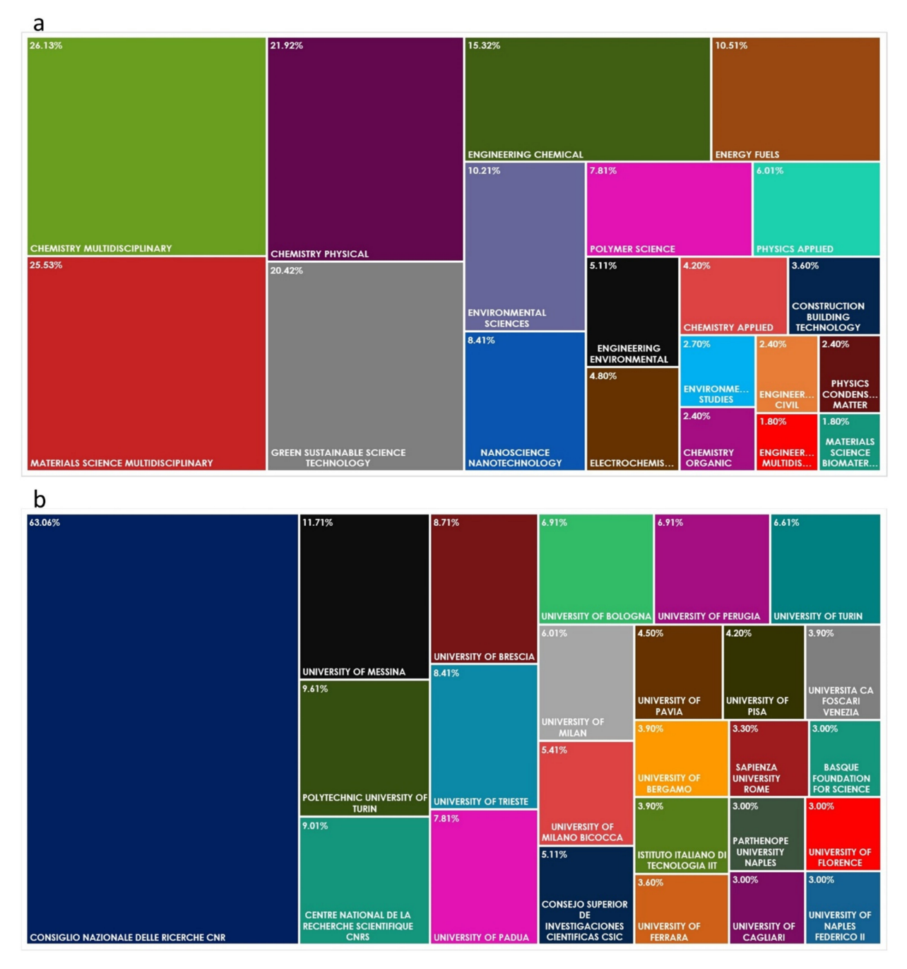
Figure 2. Web of Science (WoS) categories of sustainable materials ( a ) and the INSTM research units working on sustainable materials topic ( b ). Publications from 2016 to 2020 were considered.