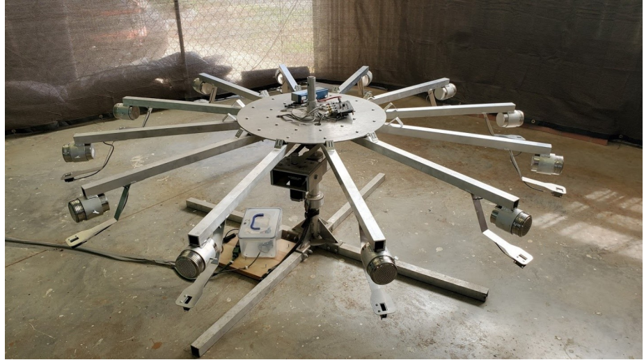
Fig 1. Scent wheel used in this study.

https://doi.org/10.1371/journal.pone.0250158.g001