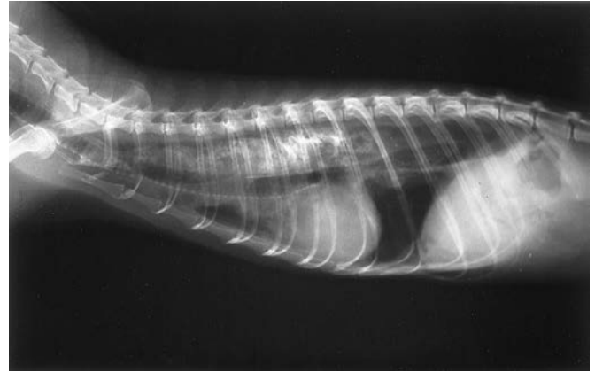
Fig. 3.3 Lateral radiograph of a ferret with megaesophagus. Orally administered barium sulfate delineates the esophagus.

Esophageal diseases are uncommon in ferrets. Megaesophagus, which describes an esophagus that is enlarged (dilated) on radiographic examination and that lacks normal motility, has been reported in ferrets and is associated with regurgitation,