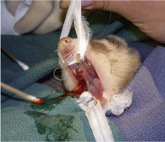
Fig. 3.1 The medial aspect of this mucocoele is marsupialized into the mouth.