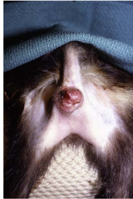
Fig. 3.5 Rectal leiomyosarcoma in a ferret.

Rectal prolapse can occur in ferrets. It is most often associated with diarrhea and is usually a disease of young ferrets. Possible causes include coccidiosis, proliferative bowel disease, colitis, and neoplasia.