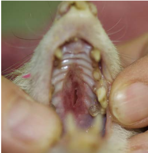
Fig. 3.2 Ulceration of the palate and oronasal fistula in a ferret.

ulcers with liquid sucralfate (100 mg/kg every 6 hours) and a gruel made of soaked kibble until the ulcer heals. In advanced cases, oronasal fistulas can form and can be difficult to repair surgically (Fig. 3.2). 80