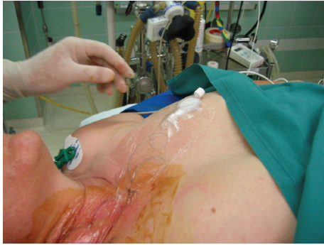
FIGURE 2: Sterile catheter dressing after catheter tunneling.

been for a long time the most wide-spread technique and is still used, nerve stimulation has been considered the gold standard at least until the introduction of ultrasound in 1989 [53]. Using electrical current to place an insulated needle close to a peripheral nerve to inject local anesthetic or place a perineural catheter is the basic principle of nerve stimulation [54]. Without doubt, if properly used nerve stimulation offers a high success rate for sPNB and for cPNB [55–62]. The most important rules to achieve competitive success rates for sPNB are