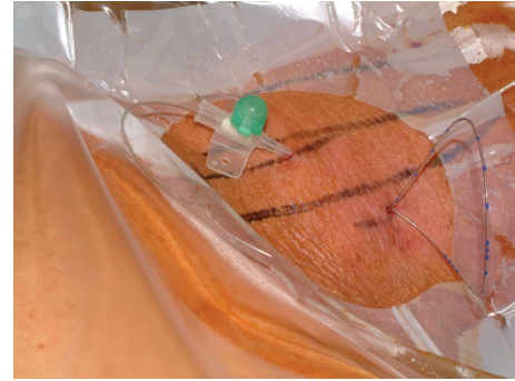
FIGURE 6: Catheter tunneling.

both techniques [96–98]. Regrettably, in most of these publications the inappropriate use of neurostimulation lead to intolerable low success rates (<80%). Moreover, surrogate outcome like needle passes through the skin, needle time under the skin, patient satisfaction, local anesthetic volume, and other parameters of doubtful clinical importance have been introduced to compare these techniques. The comparison of ultrasound with stimulating catheters shows a similar picture: ultrasound is at least as effective with improvement of insertion-related discomfort and insertion time [93, 99]. The limited length and the main focus of this