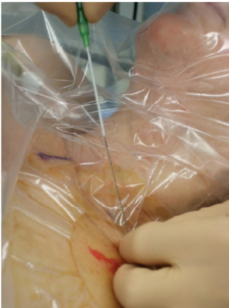
FIGURE 5: Cannula removal leaving the catheter in place.

both techniques [96–98]. Regrettably, in most of these publications the inappropriate use of neurostimulation lead to intolerable low success rates (<80%). Moreover, surrogate outcome like needle passes through the skin, needle time under the skin, patient satisfaction, local anesthetic volume, and other parameters of doubtful clinical importance have been introduced to compare these techniques. The comparison of ultrasound with stimulating catheters shows a similar picture: ultrasound is at least as effective with improvement of insertion-related discomfort and insertion time [93, 99]. The limited length and the main focus of this