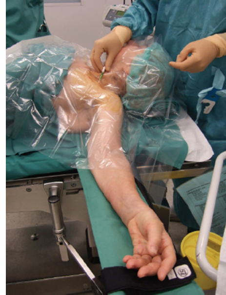
FIGURE 1: Sterile precautions for regional anesthesia.

In western countries, 50–70% of in hospital patients suffer from moderate-to-severe pain after surgery [28], and 40% of ambulatory surgical patients have moderate/severe pain during the first 24–48 h [29]. Orthopedic surgery remains the major indication for peripheral nerve blocks for anesthesia and postoperative analgesia [30]. Orthopedic surgery is one of the most if not the most painful surgery [31, 32]. In fact, after orthopedic surgery significant increases in pain scores may persist for 2 to 3 days [33, 34]. In postoperative evaluations of hip and knee surgeries using questionnaires 28% of patients after total hip arthroplasty [35] and 33% of patients after total knee arthroplasty [36] suffered from chronic pain. The common finding between these patients was the intensity of immediate postoperative pain. Intense persistent postsurgical pain has indeed been described as a risk factor for the development of chronic pain [37, 38]. Therefore, an improvement in postsurgical pain therapy could be an important factor to reduce pain chronification and its adverse effects on health system costs [39] (Table 1).