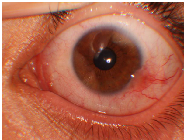
Figure 3 Clinical photograph of a nodular lesion in the bulbar conjunctiva.

The causes of poor eyesight are varied, with chorioretinal atrophy, congenital cataract, optic atrophy, retinal disease, complicated cataract, leucoma, coloboma, high myopia, congenital glaucoma, penetrating trauma, contusional eye