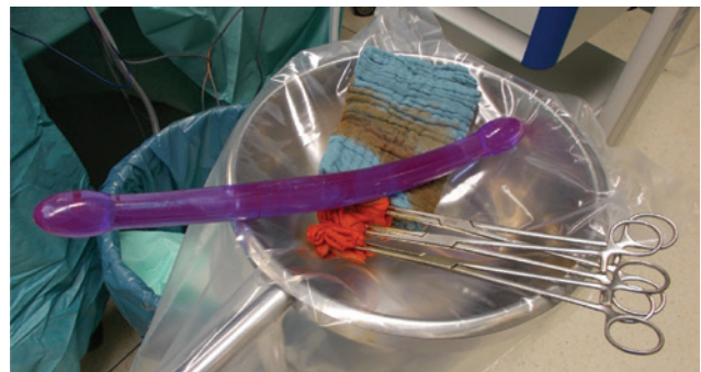
Figure 5: This 40-cm-long dildo perforated the sigmoid. This dildo was extracted by media laparotomy.