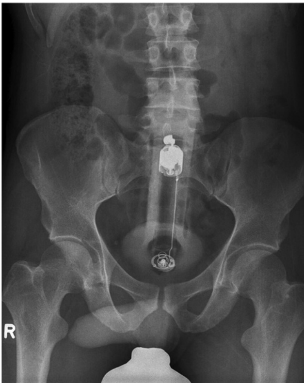
Figure 3: Complete perianally inserted vibrator.

of the sphincter muscle. The first case was a 26-year-old man with an inserted apple and the second one was a 27-year-old woman from the psychiatric department with