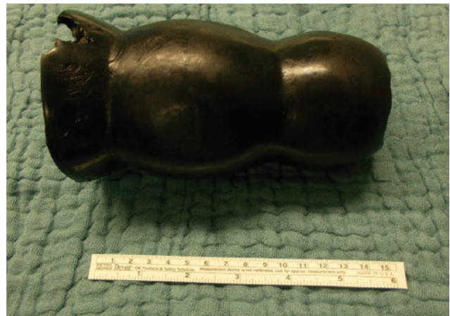
Figure 4: This plug was removed by laparotomy. Because of the vacuum that was built by the RFB, all conservative efforts failed.

After removing the RFB, colonoscopy was made in five cases. Just in one case, there was a rectal injury with