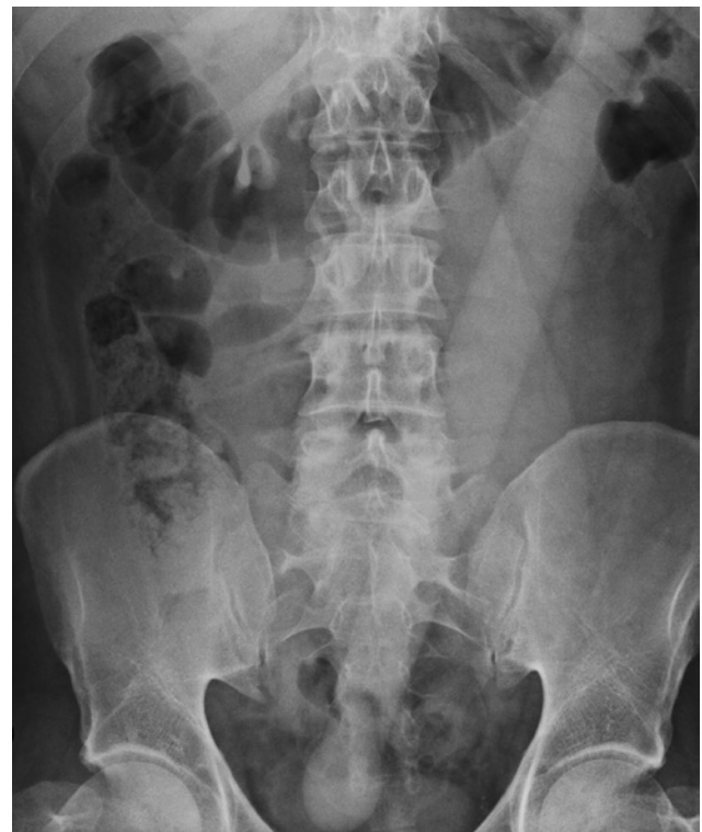
Figure 1: After rectal perforation, free-lying dildo in the abdomen.

In 16 cases, this first attempt of removal was successful and the patients were discharged from the emergency room without further complications. In two cases, the removal of the foreign body was possible in the emergency room by applying analgesia. Two patients were transferred to the operating theater and the foreign body was removed under general anesthesia and full relaxation