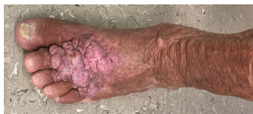
FIGURE 6: Highly differentiated squamous cell carcinoma of the skin on the dorsum of the left foot of the lower leg, four years after an infection by Vv.

skin graft and chronic lymphedema (Figures 6, 7(a), and 7(b)). The primary was excised. In the further course, the patient could be released into the home environment