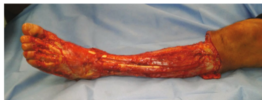
FIGURE 2: After emergency superficial necrosectomy of the necrotizing fasciitis of the left lower leg.

study from Taiwan demonstrated that the combined use of a third-generation cephalosporin with tetracyclines was associated with a better outcome [14, 15]. The most frequent reports come from the USA (East Coast), Japan, and Taiwan [13, 16]. In this case report, we present a fulminant Vv infection of the lower limb that was successfully treated without amputation, hence developing a highly differentiated squamous cell carcinoma of the affected limb in the long-term after split skin graft and chronic lymphedema four years after surviving the infection.