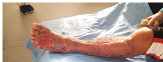
FIGURE 4: Left lower leg 3 months after split skin graft.