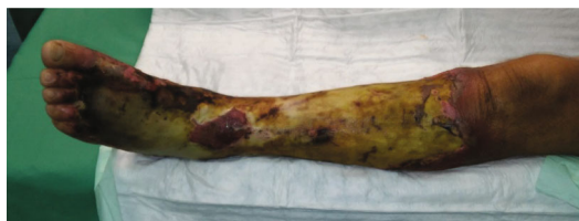
FIGURE 1: Necrotizing fasciitis of the left lower leg with Vv.