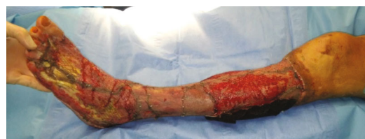
FIGURE 3: Left lower leg after the first split skin graft.