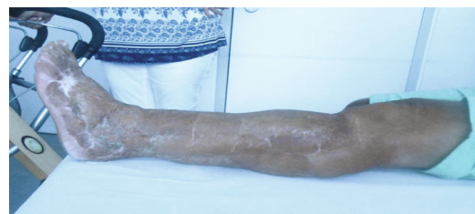
FIGURE 5: Two years after necrotizing fasciitis of the left lower leg with Vv.