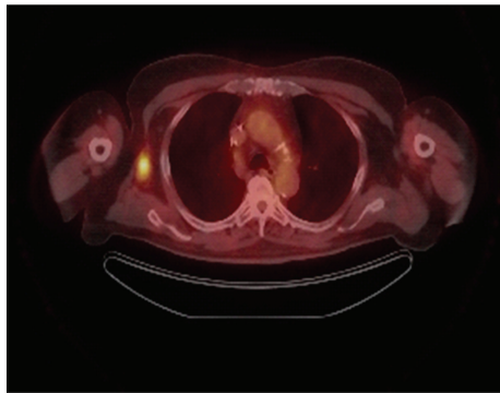
FIGURE 1: Lymph node uptake.

changed the surgical treatment plan in 11% of our cases, and systemic chemotherapy (temozolomide) was added in 7% of our cases due to the finding of metastatic disease (Table 2). Six patients (11%) proceeded directly to therapeutic lymph node dissection due to the preoperative PET/CT findings, thereby eliminating the need for sentinel lymph node biopsy (SLNB). In all six cases, the reason for performing the therapeutic lymph node dissection rather than the SLNB was the depth of the primary melanoma, the presence of clinically detected lymphadenopathy, and the presence of PET/CT avid lymph nodes (patient number six did not undergo SLNB do to clinically evident disease in the inguinal region). Based on the findings of metastatic disease on the preoperative PET/CT, four patients were presented in a multidisciplinary tumor board for discussion of systemic chemotherapy and the possibility of having been enrolled into a clinical trial. Patient number three in Table 2 with metastatic disease in the liver underwent operative intervention with right axillary dissection for debulking and palliation only not for curative intent.