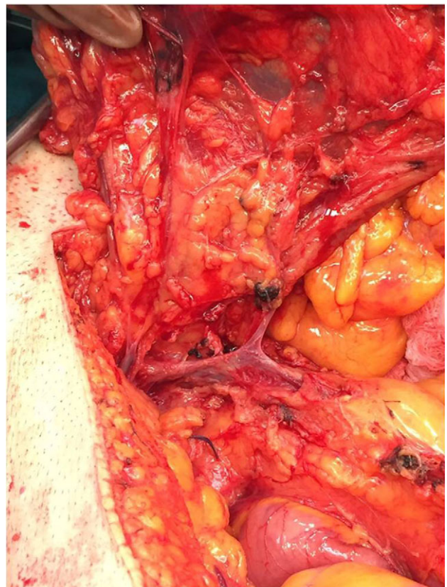
Figure 2: The venous anatomy of the right colon in our case.