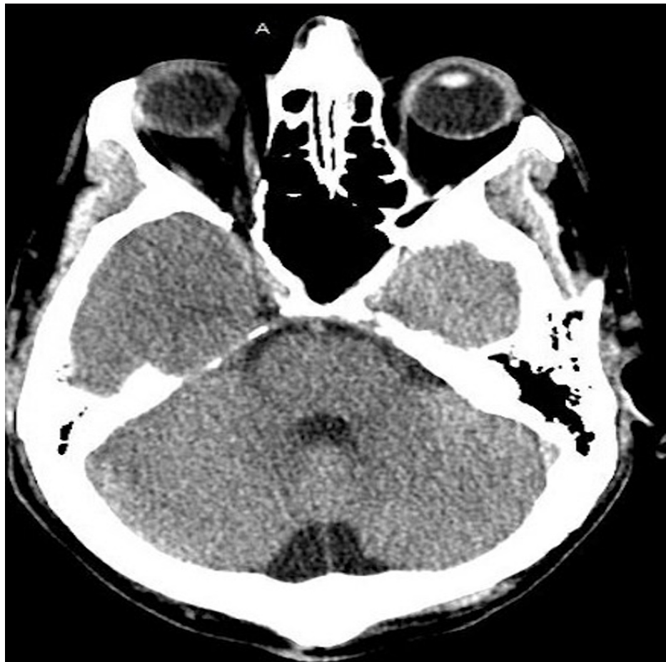
FIGURE 1: CT scan of the head without contrast.

Unremarkable CT scan of the head showing no intracranial pathology.