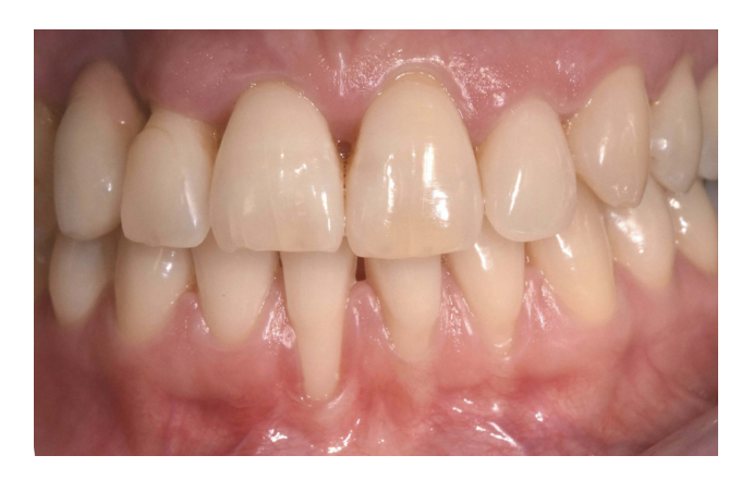
Figure I Gingival recession in tooth 4.1.

Physical examination using a periodontal probe revealed the probing depth, and slight reabsorption of interproximal bone peaks was noted which was confirmed by intraoral radiography (Figure 2). This led us to define