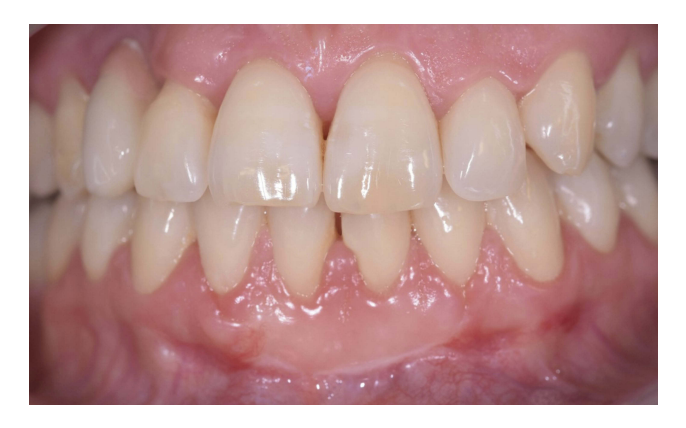
Figure 6 Resolution of gingival recession 30 days after the procedure.

able to operate on all the incisors at the same time, achieving excellent alignment and with the additional disinsertion of all the relevant fibres of the labial frenulum.