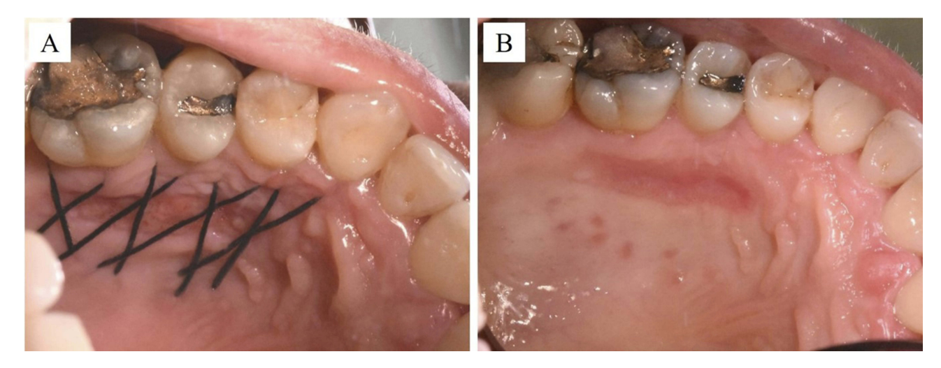
Figure 7 Reepithelialization of the palate 14 days after HAM grafting, before (A) and after (B) removal of stitches.