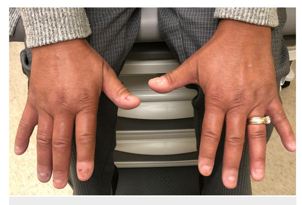
FIGURE 1: Physical exam findings of puffy fingers, sclerodactyly of the fingers, and skin hyperpigmentation