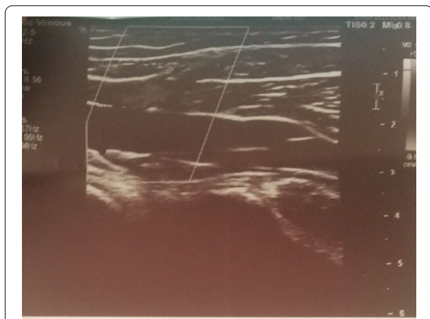
Fig. 1 Doppler of proximal end of Superficial Saphenous Vein