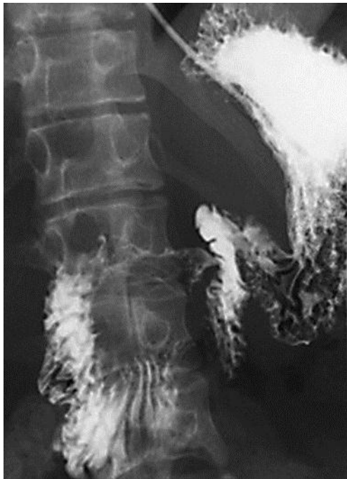
Fig. 3. Barium study showing delayed transit through the third part of the duodenum.