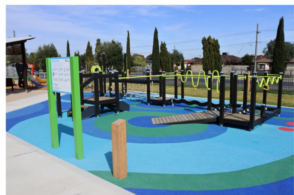
Fig. 2 The Senior Exercise Park (Lark Industries and Lappset Group) at Thomastown, Melbourne Victoria

The Senior Exercise Park equipment (Lark Industries, Australia) is outdoor playground equipment specifically designed for older people to improve strength, balance, joint movements and overall mobility and function (Fig. 2). It comprises multiple equipment stations that target specific function or movement (upper and lower