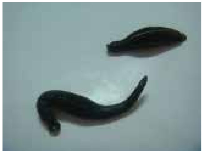
Figure 2. Appearance of Medicinal Leech.