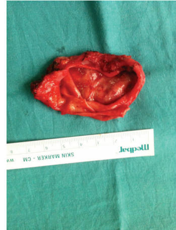
FIGURE 3: Resected cystic lesion.

Bronchogenic cysts are sacs filled with fluid. The radiologic diagnosis may be difficult because of air-fluid level or variable protein content as in case of an infection [5, 9]. As in our case, computerized tomography aids in preoperative diagnosis; however, differentiation between infections such as hydatid disease, a malignancy, or for the exact origin (i.e., pericardial, enteric, bronchogenic, or others) of the