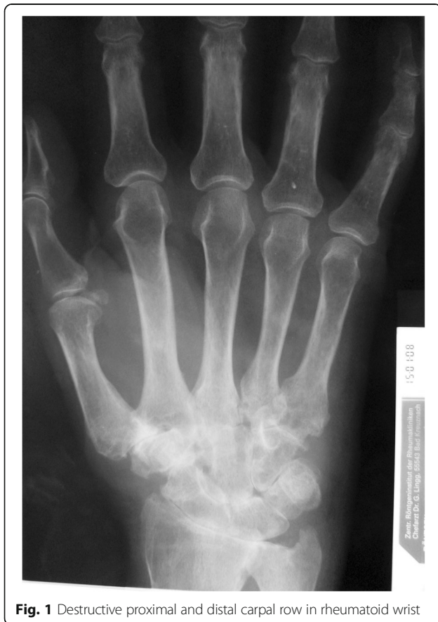
Fig. 1 Destructive proximal and distal carpal row in rheumatoid wrist

All patients were examined according to a special protocol. Basic information was recorded, including age, gender, affected side, duration of the disease and date of operation. They were further asked about pain, swelling and certain daily activities. The daily activities were evaluated according to a specially designed questionnaire (modified PROMs) that identified difficulties with common daily activities that could be affected by rheumatoid arthritis (functional questionnaire score, Additional file 2). The score is equal to the