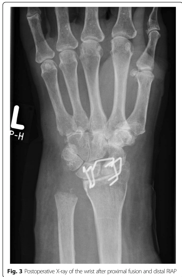
Fig. 3 Postoperative X-ray of the wrist after proximal fusion and distal RIAP

Quick-DASH-Score, using the same questions about daily life (Using a knife and fork for eating, hygiene, hair styling, using scissors, elevation of a hat, picking up coins, writing, lying down over the hand, using the keys and opening a bottle). A careful clinical and radiological examination was done to evaluate the degree of joint destruction according to the Larsen-Dale-Eek [20] and Simmen and Huber [17] classifications. The carpal height index and ulnar translation index [21] were also measured.