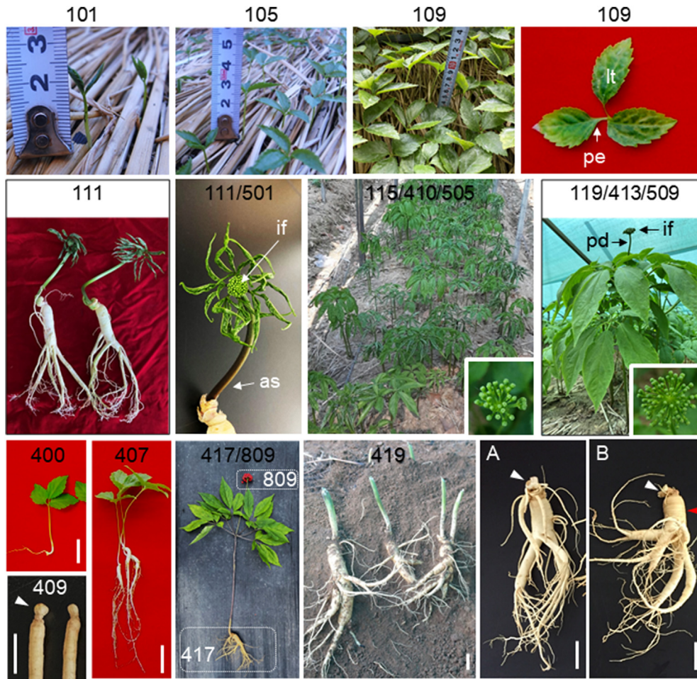
Fig. 2. Leaf and root developmental phenophases of P. ginseng with corresponding BBCH codes. (A and B) Harvested six-year-old P. ginseng and P. quinquefolius , respectively (white arrows = perennating bud, red = wrinkled marks). as, aerial shoot; if, inflorescence; pd, peduncle; pe, petiole. Bars = 30 mm.

109, Fig. 2). Like the P. quinquefolius seedlings, the leaflet is elliptical, serrated, and have small trichomes along the upper surface of the midrib [15]. In older (2- to 6-year-old) reproductive plants, the aerial shoot arises from a perennating bud bearing several penta-foliolate leaflets or an inflorescence (stage 111, Fig. 2). It is uncommon for second-year ginseng to develop inflorescences, but only 5%–10% of the plant have them [18]. The shoot primordium grows vertically for further development. Meanwhile, the penta-foliolate leaflet does not unfold until mid-April, and its aerial shoot reaches 20% of its expected height (stage 111, Fig. 2). After about 20 d, most leaves are unfolded, and the aerial stem is about 100–250 mm (stage 115, Fig. 2). The ginseng canopy is completed when all penta-foliolate leaves are unfolded and horizontal, the aerial stem has reached maximum height (ca. 500 mm), and the inflorescence is exposed and erect (stage 119, Fig. 2).