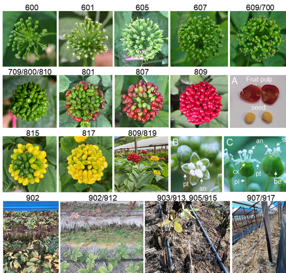
Fig. 3. Flower/fruit developmental phenophases and senescence of P. ginseng with corresponding BBCH codes. (A) Fruit and isolated seeds. (B) Flower. (C) Fertilized flowers. an, anther; be, berry; cx, calyx; pl, pedicel; pt, petal; st, stigma.

The green berries that matured during the previous growth stage (stage 800 and 810, Fig. 3) gradually start to change color from green to red (stage 801, Fig. 3) or yellow (stage 811). Specifically, the