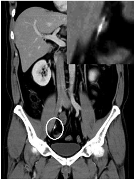
Fig. 1. Intraperitoneal protrusion of the tip of the foreign body was suspected.