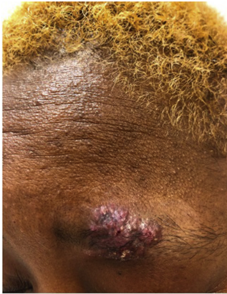
Fig 1. Blastomycosis. Physical examination of the lesion revealed a well-demarcated, violaceous, verrucous plaque with raised borders and an exudative crust at the base.