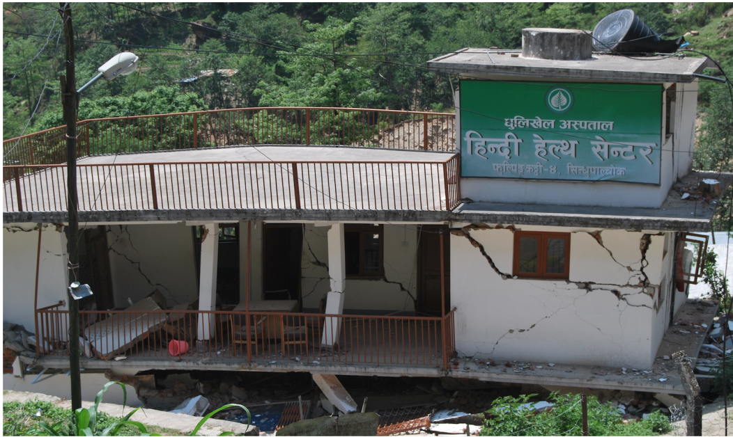
Fig 1. Collapsed outreach center of Dhulikhel Hospital, Kathmandu University Hospital ( http://www.dhulikhelhospital.org ). This image highlights a water tank that has fallen off the pedestal on the roof of a clinic. The inability to safely store water is one of many reasons why clean water has become scarce across Nepal.