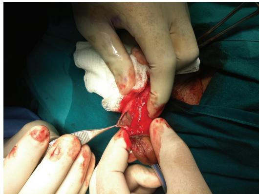
FIGURE 2: Inside of the cyst showing normal penile skin.