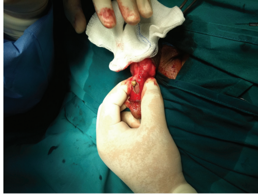
FIGURE 1: Retrieval of the stones from inside the cyst.