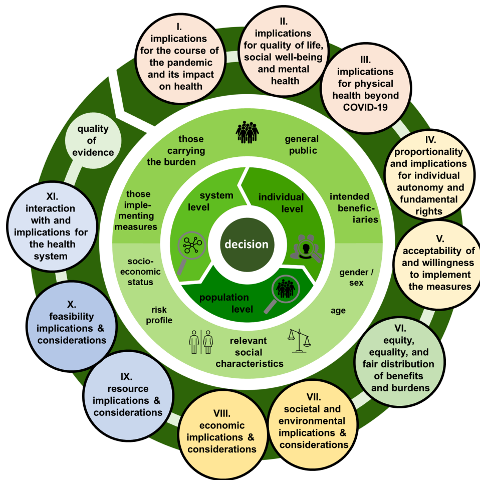
Figure 1 WICID framework version 1.0. The colour of the 11+1 criteria of the WICID refers to their grouping and relation to the criteria of the WHO-INTEGRATE framework they are derived from. The center-most circle describes population groups onto which the criteria and aspects should be applied to. The innermost circle describes the perspective the decision-makers can take onto criteria and populations. WICID, WHO-INTEGRATE COVID-19.

aspects, and the meta-criterion quality of evidence, to be applicable across all criteria and aspects (outer circle, figure 1; tables 1 and 2). Depending on the intervention, the criteria and aspects are intended to be applied on and reflected for different population groups (center-most circle, figure 1). Depending on the measure and type of decision-making process, the decision-makers are intended to deliberate on the criteria and aspects taking one or multiple different perspectives (inner circle, figure 1). Analogous to the WHO-INTEGRATE framework, it aims to accommodate different features of complexity: depending on the impact the measure is assumed to have on the system it is implemented in, direct (those caused by the intervention) and indirect (those resulting from the system reactively changing due to the intervention) effects should be taken into account, as well as local, regional, national and even global implications. At the same time, both the immediate and the short, medium-term and long-term implications should be considered (figure 2). It is intended to guide the systematic reflection of the intervention in its context.