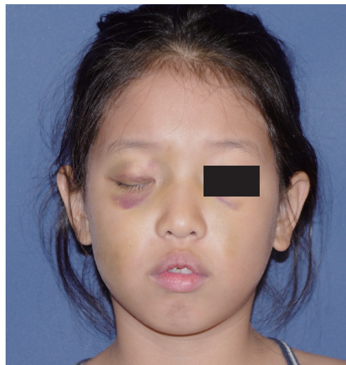
Fig. 1. One week post-trauma. Complete ptosis and a dilated pupil were noted.