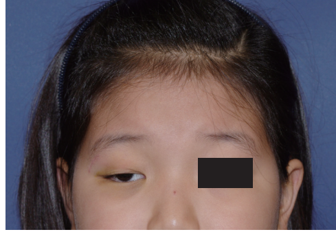
Fig. 3. Eight weeks post-trauma. Levator function was improved compared to at 4 weeks.