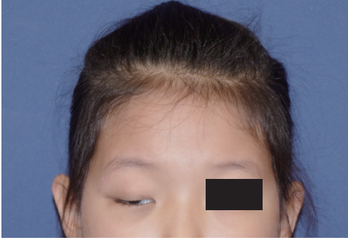
Fig. 2. Four weeks post-trauma. The movement of paretic extraocular muscles and the amount of ptosis were somewhat improved. Levator function was measured as no more than 3 mm.