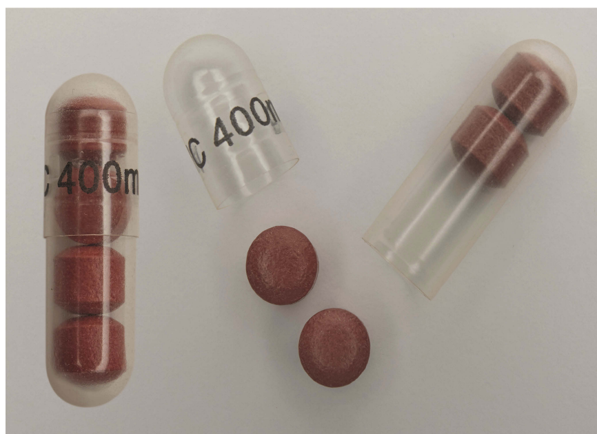
Figure 1 Capsule formulation containing four mesalamine 100 mg tablets (total closed length 23.5 mm, external cap diameter 7.65 mm).

This single-center, open-label, replicate-treatment, single-dose, randomized crossover study compared the bioavailability of delayed-release mesalamine 400 mg tablets and delayed-release mesalamine 400 mg capsules containing 4 \times 100 mg tablets (Figure 1) in fasted volunteers and evaluated the effect of food on the bioavailability of the 400 mg capsule. The study consisted of five treatment periods, with all volunteers receiving a single delayed-release mesalamine tablet while fasted on two separate occasions, a single delayed-release mesalamine capsule while fasted on two separate occasions, and a single delayed-release mesalamine capsule with food. Volunteers were randomized to receive the treatments in one of four treatment sequences. For each treatment, volunteers fasted for \geq 10 hours prior to dose administration. Volunteers receiving delayed-release mesalamine capsules with food were given