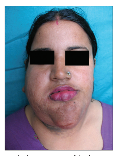
Figure 1: The unesthetic appearance of the face

A panoramic radiograph disclosed asymmetric enlargement of the right side of the mandible, with