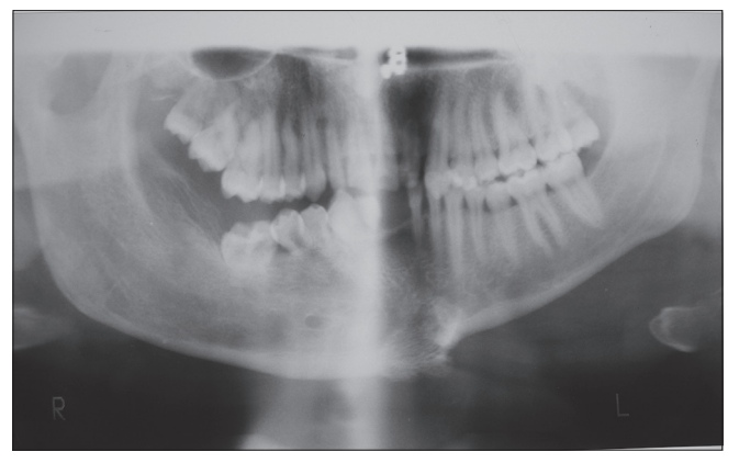
Figure 6: A panoramic radiograph

Neurofibromatosis is often diagnosed because of unusual pigmentary patterns. The café au lait spots are irregularly-shaped, evenly pigmented, brown macules. Most individuals with neurofibromatosis have six or more spots that are 1.5 cm or greater in diameter. In young children, five or more café au lait macules, greater than 0.5 cm in diameter, are suggestive of neurofibromatosis. Less than 1% of the healthy children have three or more such spots, although one or two café au lait macules are commonly encountered in healthy individuals without disease. [1-2,5]