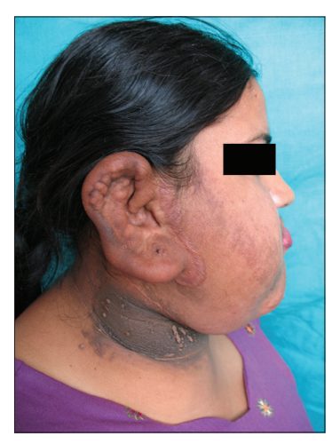
Figure 2: Nodular growths localized on the right side of the neck with dark colored underlying skin

The histopathological slide revealed a non-encapsulated tumor of the dermis with a normal overlying epidermis. The tumor consisted of loosely spaced spindle cells and wavy collagenous strands in a clear matrix [Figure 8].