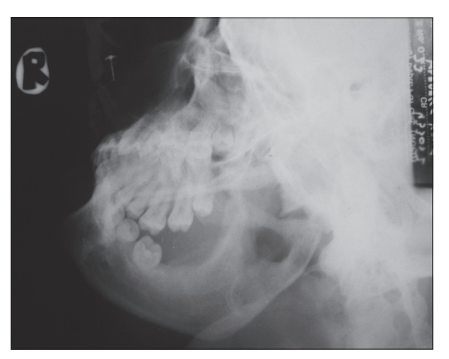
Figure 7: A right lateral oblique radiograph