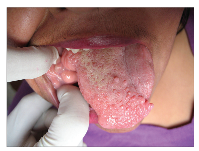
Figure 5: Soft tissue growths with sessile bases on the tongue