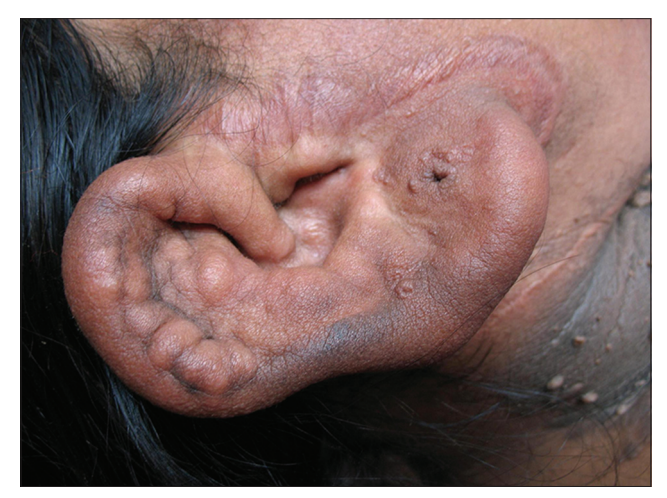
Figure 3: Disfigurement of the ear and hypertrophy with thickened cartilage and overlying hyperpigmented skin

loss of cortication of the lower border in the midline area, expansion of the body of the mandible causing displacement of the teeth, seen on right side, expansion of the right inferior alveolar nerve canal, enlarged mental foramen, resorption of the roots of the mandibular right teeth, and loss of the right antegonial notch. A deficiency was seen on the right side of the maxilla, with crowding of the posterior teeth [Figure 6].