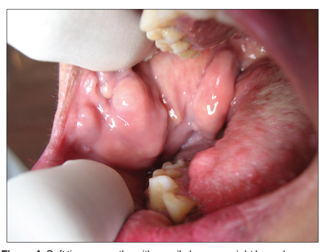
Figure 4: Soft tissue growths with sessile bases on right buccal mucosa