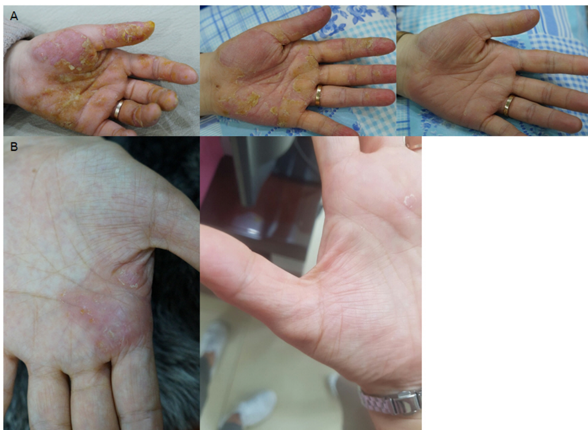
Figure 1. Hand eczema before and after treatment. (A) Case 1: before, 1 week after treatment, and after treatment; (B) Case 2: before and after treatment.

blisters and redness only on the hands. On the basis of these features, a diagnosis of hand eczema was made. In case 1, based on the characteristic of deterioration according to diet, this type of eczema included aspects of atopic hand dermatitis. In case 2, considering the possibility of contact with preservatives in cosmetics during her job activities, a diagnosis of allergic contact dermatitis was speculated. Case 1 was treated with SVP (KPRI, Wonjusi, South Korea) at a dose of 2 mL twice per week (i.e., eight times a month), and case 2 was treated with 0.5 mL of SVP five times for a week [5]. A sterile hypodermic syringe (30 gauge, 1.0 mL; DM Medicrat, Seoul, Korea) was loaded onto a mesogun (Dr. Injector, MSG-500, MOOHAN Co., Ltd., Gwangjusi, Gyeonggi-do, South Korea), and 0.1 mL per point was injected in a standard mode. In total, 10 and 5 points were injected on each palm at a time based on the affected area (Supplemental Video). The treatment was well tolerated, and no adverse events were reported. Case 1 reported that the procedure was very painful but showed an improvement each week. Epidermal detachment was observed before treatments, especially