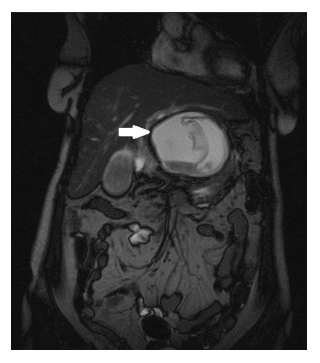
Fig. 3. MRCP image showing hematoma in gall bladder (magnetic resonance cholangiopancreaticography).

administered. The patient stayed stable hemodynamically; therefore we did not make any intervention for hemorrhagia. During the following three days, patient was stable, fed orally. When the laboratory findings decreased to normal values, the patient was discharged on 26th of July.