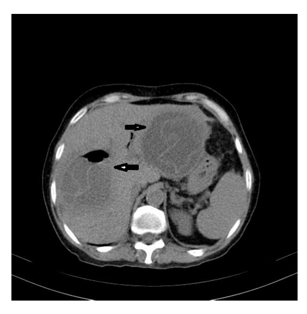
Fig. 1. CT image showing the hydatic cyst that PAIR was performed.

B. Sevinç et al. / International Journal of Surgery Case Reports 8 (2015) 189–192