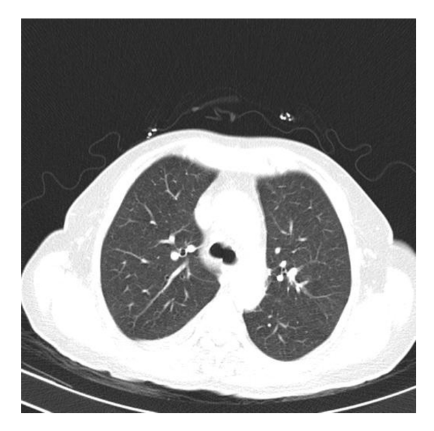
Fig. 7. Thorax computed tomography, treated pneumonia.

At her control visit on the 22nd of November, at abdominal ultrasonography cyst cavity at right lobe was disappeared and postoperative changes were seen. The cyst at left lobe was measured 56 \times 40\,\mathrm{mm} in diameter. She gained 4\,\mathrm{kg} after her last discharge.