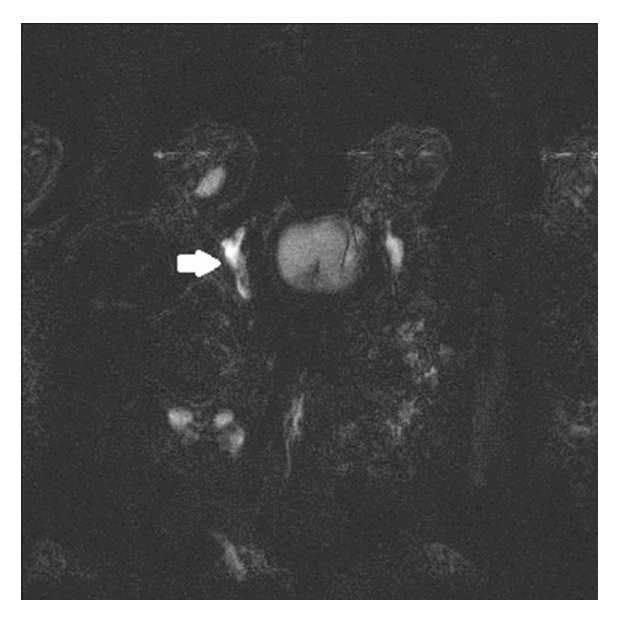
Fig. 4. MRCP image showing hematoma filling the common bile duct, magnetic resonance cholangiopancreaticography.

She stayed at 3rd degree ICU and had mechanical ventilation support for 8 days because of severe pneumonia. Culture