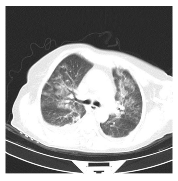
Fig. 6. Thorax computed tomography showing pneumonia.

results of both two abscess and sputum revealed acinetobacteria and enterococus. According to those culture results and suggestions of infectious diseases specialist, she had been under therapy with sulbactam-sulpherazon (2 \times 1 go), amikacin (2 \times 500 mg) and vancomycin (4 × 500 mg). After the infectious clinic had been recovered, on the 19th of August blood drained from the drainage tube located in cyst cavity in left hepatic lobe and she had melaena for two times. Besides, she did not need any blood transfusion and two days later her stool was normal. Dynamic liver computerized tomography revealed no reason such as vessel abnormality or aneurysm that can explain the hemorrhage. We prepared for arterial embolization; however, there was no need for this intervention. After the drainage tubes had been removed, the patient was monitored for one week and the antibiotheraphy continued. After one week monitorization she had no problem and was fully healthy. She was discharged from the hospital on the 31st of August. Two weeks later on the 16th of September, at the first control visit, she was healthy. At plain chest x-ray athelectasia at right lower zone and radiological recover at left lung was detected (Fig. 7). At abdominal ultrasonography the hydatic cyst in the right lobe of liver was smaller.