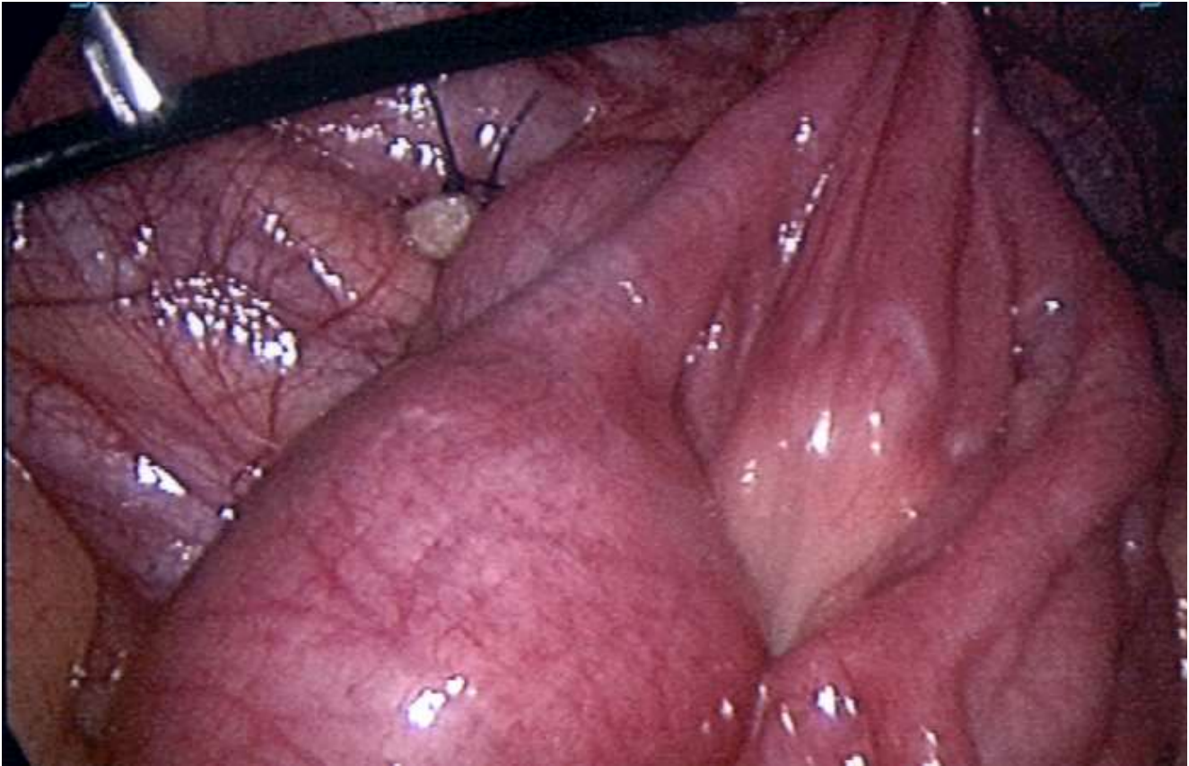
Figure 2: a laparoscopic disintussusception approach was performed, with no signs of ischemia or perforation after the reduction of the small bowel