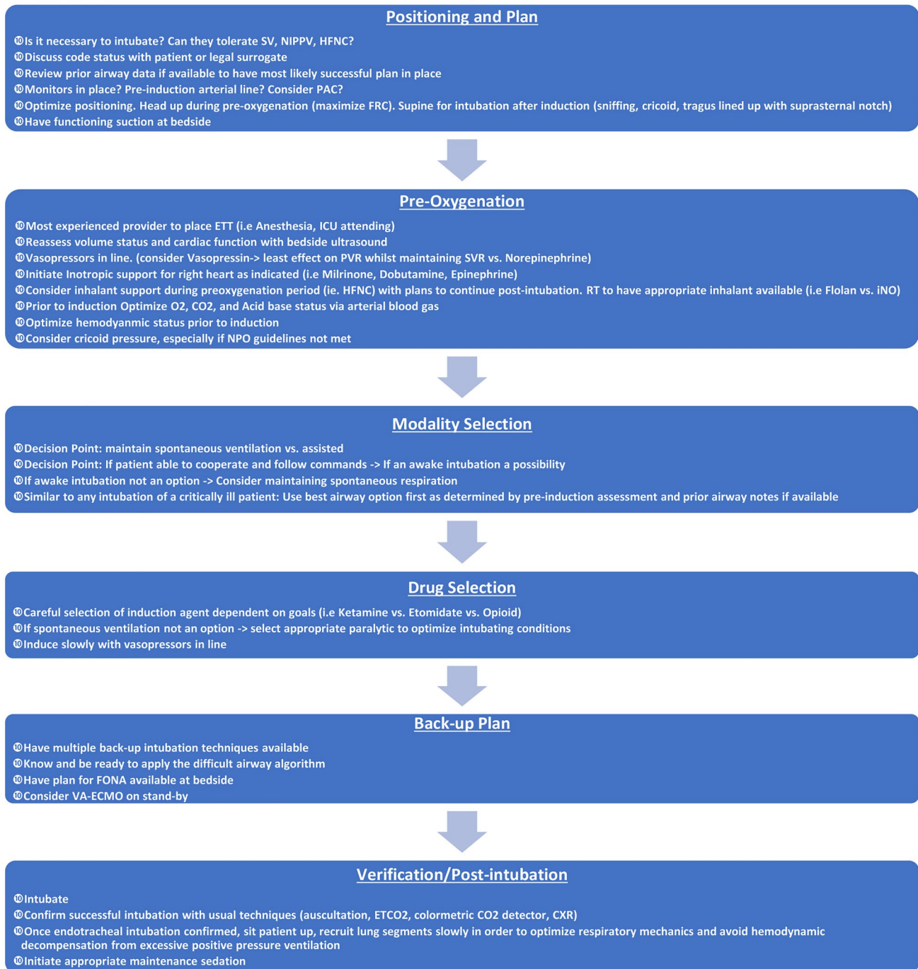
Fig. 2 Suggested algorithm on approach to intubation in dPH patients. Legend: CXR, chest X-ray; ETCO 2 , end tidal carbon dioxide; ETT, endotracheal tube; FONA, front of neck access; FRC, functional residual capacity; ICU, intensive care unit; PAC, pulmonary

arterial catheter; PVR, pulmonary vascular resistance; RT, respiratory therapist; SV, spontaneous ventilation; SVR, systemic vascular resistance; VA-ECMO, veno-arterial extracorporeal membrane oxygenation