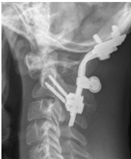
Figure 3. Two years postoperatively, plain X-ray shows unchanged position of material and no evidence for resubluxation.